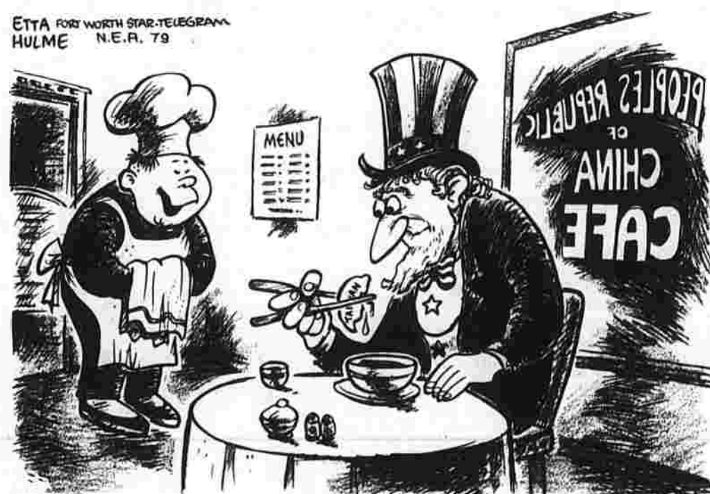
"It's the house special - Taiwan-drop soup."

The selective boycott, which will initially concentrate on companies owned by Somoza, will continue indefinitely. A major goal is to discourage the International Monetary Fund from bailing Somoza out of his economic difficulties with a $40 million loan now under consideration.