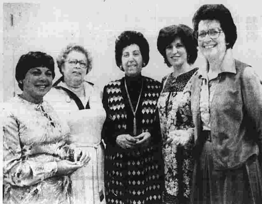
Hadassah Welcomes Life Members

Late Menus School menus for East Hartford and Coventry were not available in time for publication.