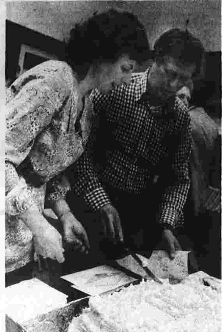
30 Years with Town

BOLTON — Bolton students in Grades 2, 5, 6 and 7 consistently scored above average on all subtests of the Iowa Tests of Basic Skills.